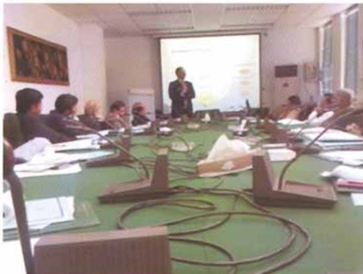
Training Course on Quality Assurance held in Finance Division.