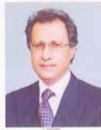
Dr. Abdul Hafeez Shaikh, Finance Minister Introduction

I also like to express my sincere appreciation to our Quality Assurance Programme (QAP) team, senior management and staff of Finance Division for the hard work and efforts in making the program a success.